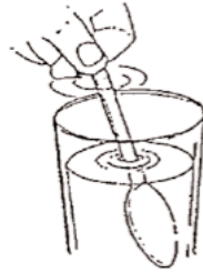
Figure 2. Mix dose in beverage or infant formula.

It is recommended that approximately half of your dosage be taken at the beginning of each meal or snack and the remainder of your dosage be taken during the meal or snack.